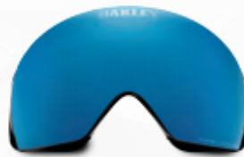
PRIZM SAPPHIRE IRIDIUM