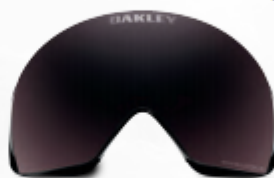
PRIZM DARK GREY

Ideal on the days that mix clouds with sunshine