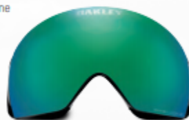
PRIZM JADE IRIDIUM