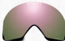
PRIZM HI-PINK IRIDIUM