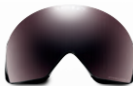
PRIZM BLACK IRIDIUM

Perfect for bright, sunny bluebird days with minimal cloud coverage