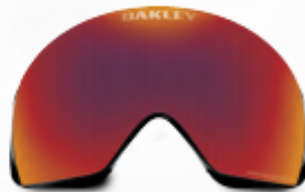
PRIZM TORCH IRIDIUM