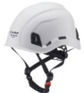
7 - White