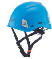
2 - Light blue