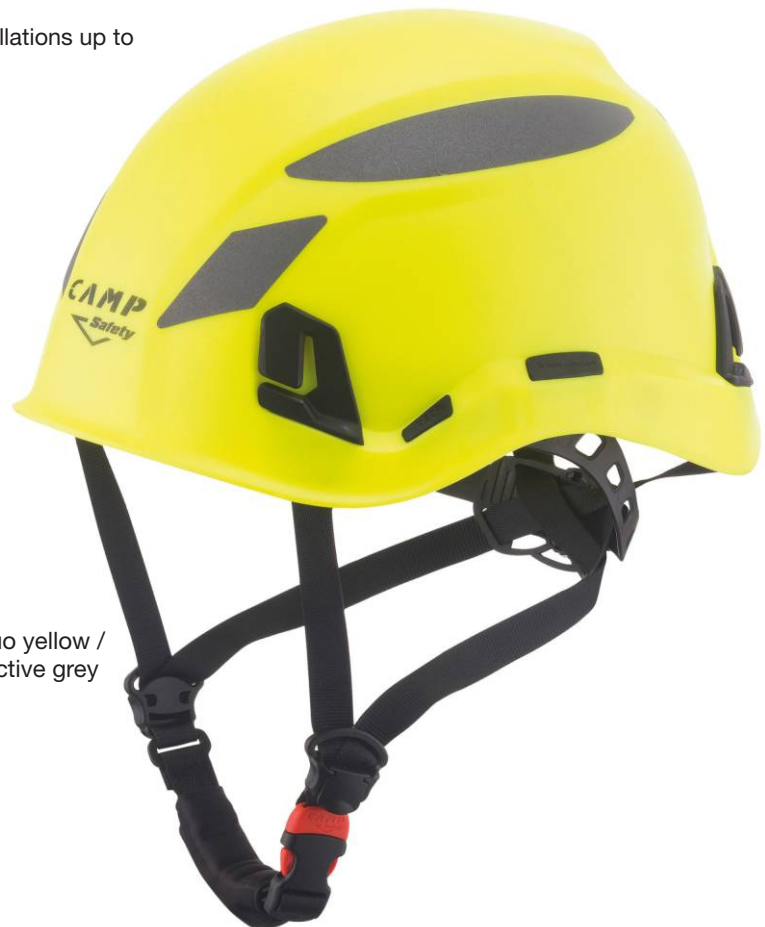
3 - Fluo yellow / Reflective grey