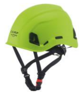
6 - Green