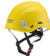
5 - Yellow