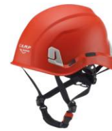
1 - Red