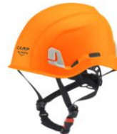
4 - Orange

ROPE ACCESS TREE CLIMBING CONFINED TOWERS/INDUSTRY ROOFS CONSTRUCTION PLATFORMS